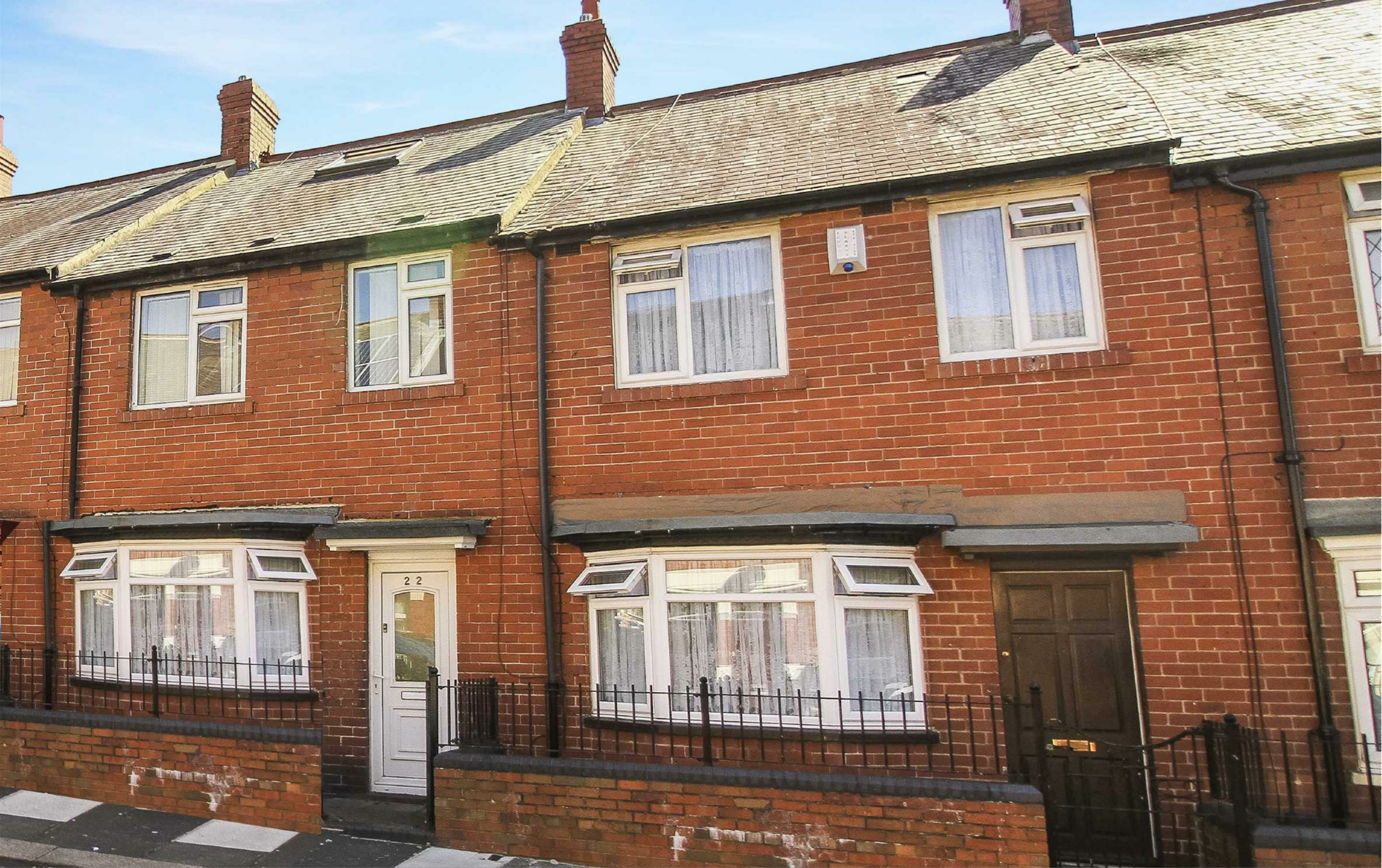
📍 Ellesmere Road, Benwell NE4 8TS